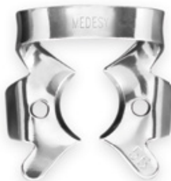
Example standard finish Esempio finitura standard 5595/56

Su richiesta è possibile ottenere tutti i ganci per diga MEDESYS con trattamento superficiale anti-riflesso per migliorare la visibilità in campo operatorio (particolarmente indicato per fotografie odontoiatriche). Aggiungere la lettera "S" dopo il codice articolo. Esempio: 5595/56 > 5595/56S