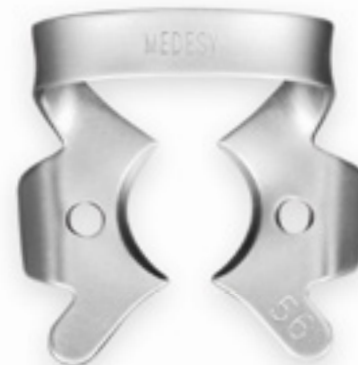
Example satin finish Esempio finitura satinata 5595/56S